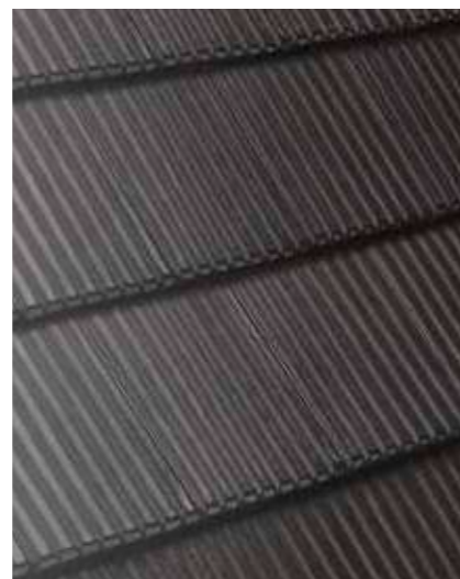
Slate (Satin) Formerly Basalt SA = 0.78 E = 0.87 BCA = D SRI = 20.2