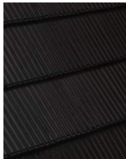
Eclipse (Satin) Formerly Onyx SA = 0.86 E = 0.87 BCA = D SRI = 10.0