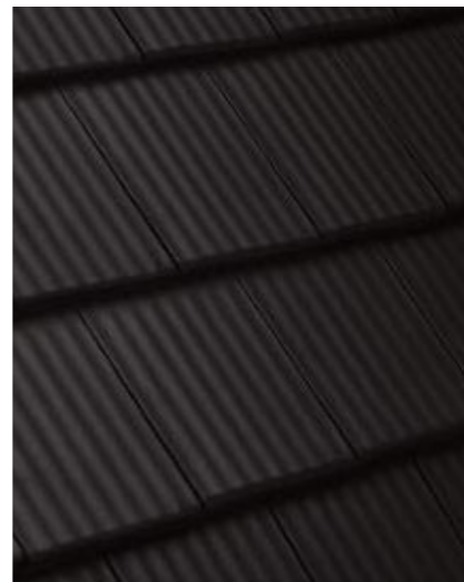
Eclipse (Matt) SA = 0.84 E = 0.86 BCA = D SRI = 11.5