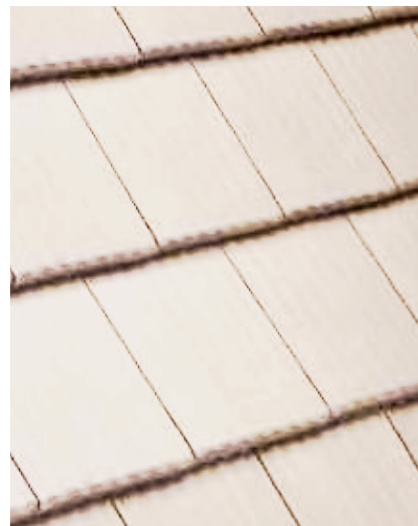
Pearl (Matt) SA = 0.35 E = 0.89 BCA = L SRI = 78.4

These state-of-the-art tiles are shaped for design flexibility with long-lasting colour integrity.