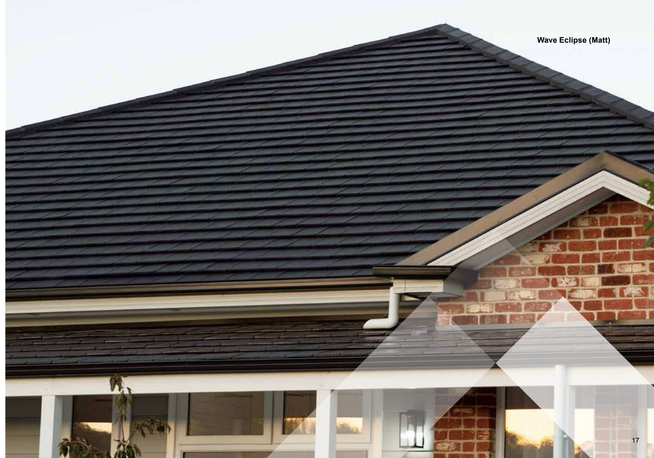
Wave Eclipse (Matt)