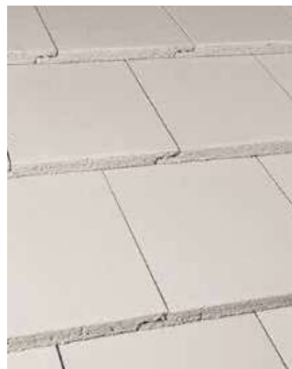
Quartz SA = 0.59 E = 0.91 BCA = M SRI = 47.7