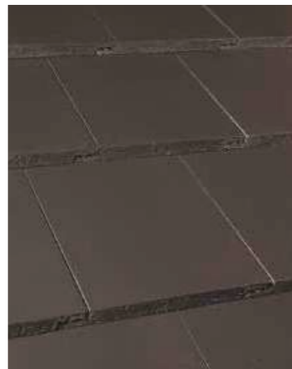
Gunmetal SA = 0.90 E = 0.92 BCA = D SRI = 6.9