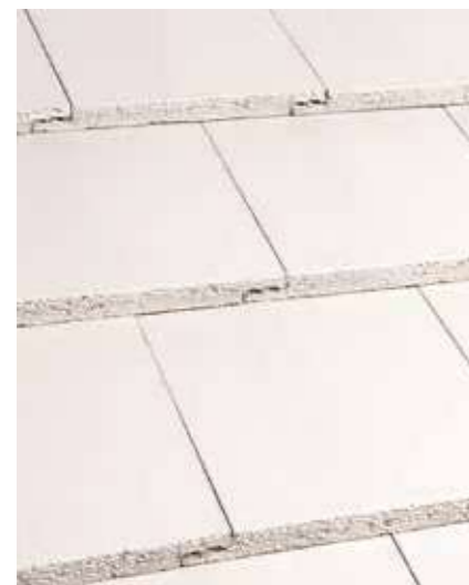
Cotton SA = 0.39 E = 0.92 BCA = L SRI = 74.3