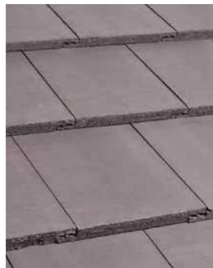
Charcoal Grey (Colour Through) Formerly Onyx in SA SA = 0.93 E = 0.91 BCA = D SRI = 3.8