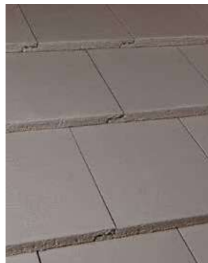
Shale SA = 0.83 E = 0.92 BCA = D SRI = 15.6