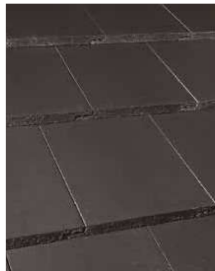
Twilight SA = 0.93 E = 0.92 BCA = D SRI = 3.1